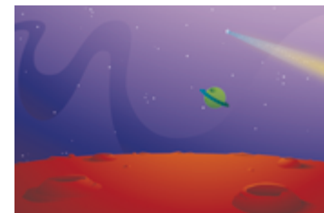
HUE HD Pro

Your downloadable HUE Animation Activity Pack also includes printable backgrounds, or you can simply create your own!