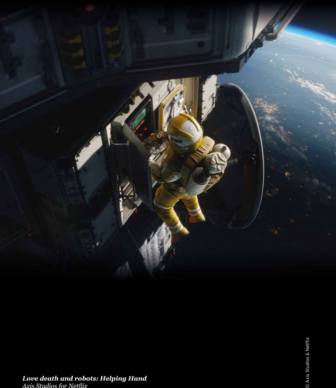
Love death and robots: Helping Hand Axis Studios for Netflix